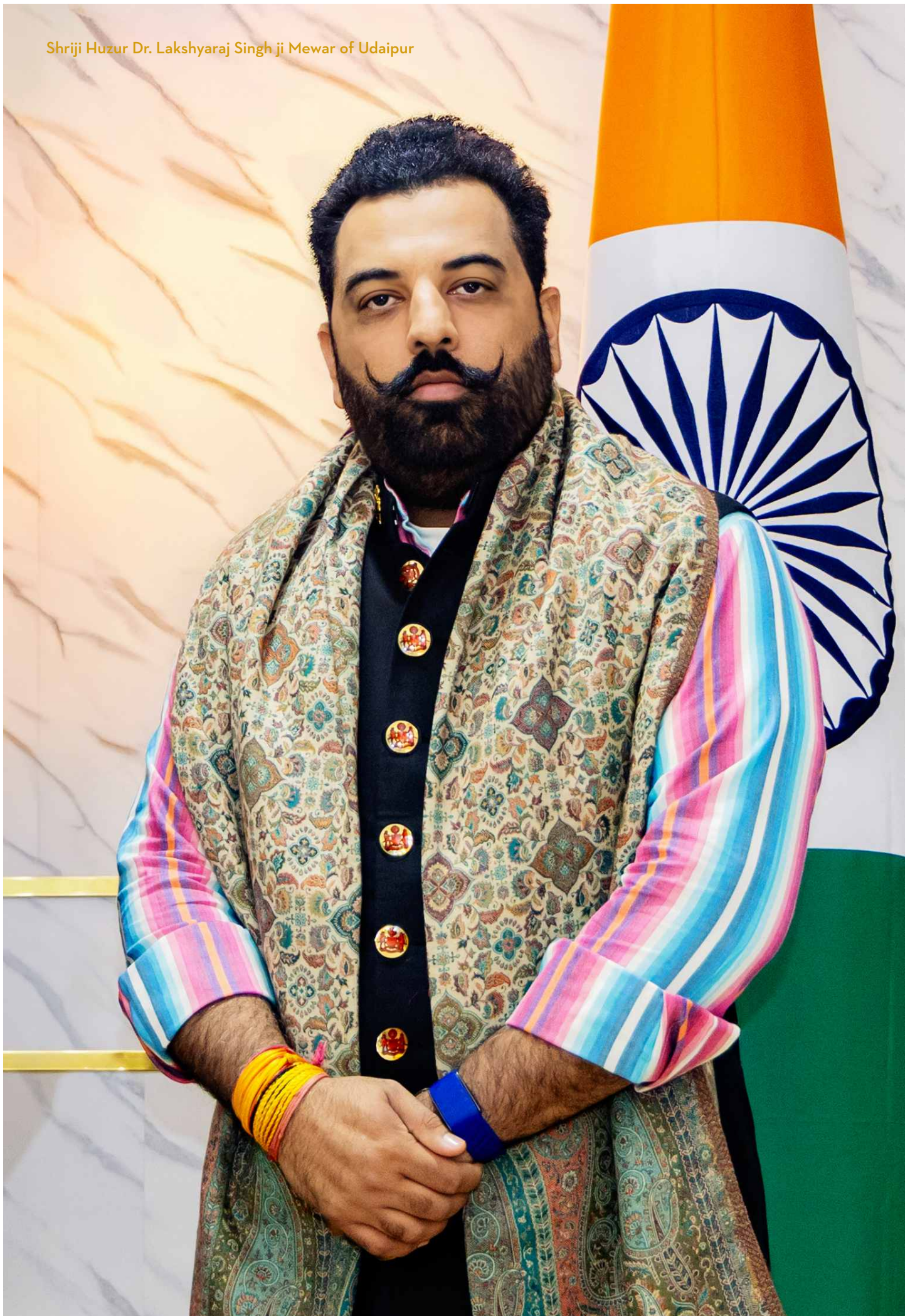
Shriji Huzur Dr. Lakshyaraj Singh ji Mewar of Udaipur